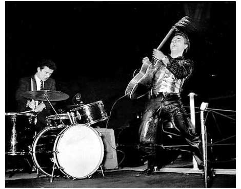
Brian Bennett and Eddie Cochran Royal Albert Hall (1961)

"Brian Bennett has been a force in British music for over 40 years. He was in the forefront of the early days of rock 'n' roll (or to be strictly accurate, at the back, because he was a drummer), part of both the innovative and influential '2 is' coffee bar scene in Soho, and of another equally important institution of the late Fifties, Jack Good's immortal television series 'Oh Boy!'. On TV and on tour he played with many of the American musical giants of the time, such as Eddie Cochran, Conway Twitty and Gene Vincent, and also with many of the original British rockers, including one of the first and best, Marty Wilde.